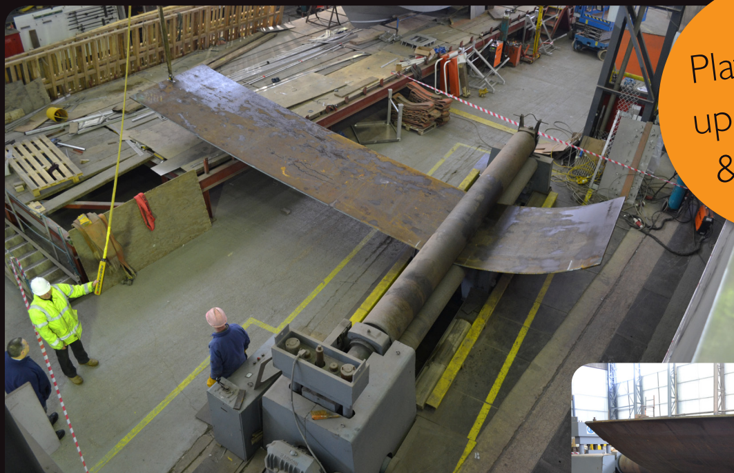
Plate Rolling up to 40mm & 6m long